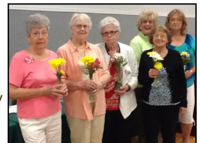
June Birthday Celebrants